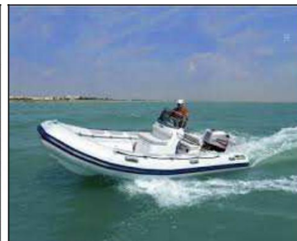
Boarding - Disembarking